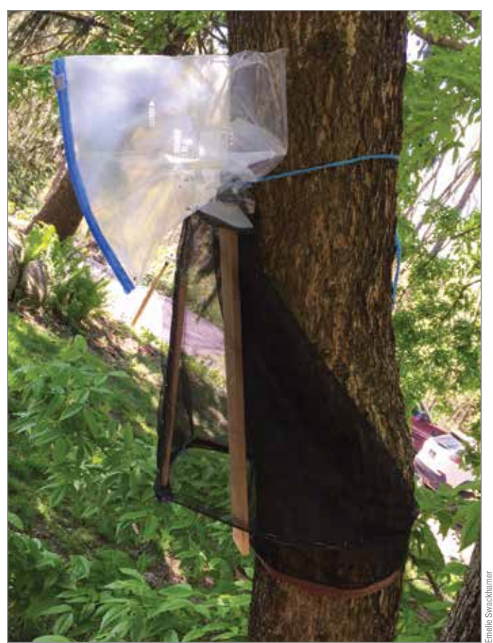
Figure 5. A funnel-style trap wrapped around a tree to capture SLF.

about trapping SLF in "Using Traps for Spotted Lanternfly Management" at extension.psu.edu/using-traps-for-spotted -lanternfly-management. Check and change traps at least every other week (or more often in highly infested areas). Be aware that this method may not reduce the number of nymph or adult SLF you see later in the year.