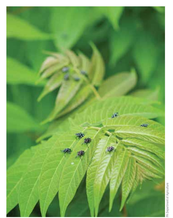
Figure 6. Early instar SLF feeding on the invasive plant tree-of-heaven.

Use recommended methods to apply herbicide to the tree from July to September and wait at least 30 days before